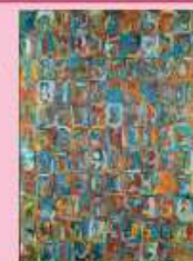
Jasper Johns, Numbers in Color, 1958-59

Jasper Johns A modern artist. He creates large and bold abstract pieces and Pop art.