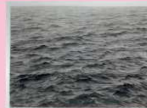
Artwork ©Vija Celmins / Matthew Marks Gallery, Vija Celmins, Untitled (Ocean), 1968

Vija Celmins She creates photorealistic paintings of the natural environment.